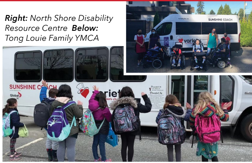
Right: North Shore Disability Resource Centre Below: Tong Louie Family YMCA

During the summer – in the face of COVID-19 – we presented a Sunshine Coach to the North Shore Disability Resource Centre who are now able to have kids visit their families ... thanks to the generosity of our donors.