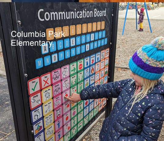
Columbia Park Elementary

Our Monthly Giving Program is vital in providing a reliable foundation of support that helps families year-round.